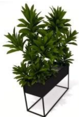
LA - 5 - B