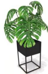
LA - 6 - B